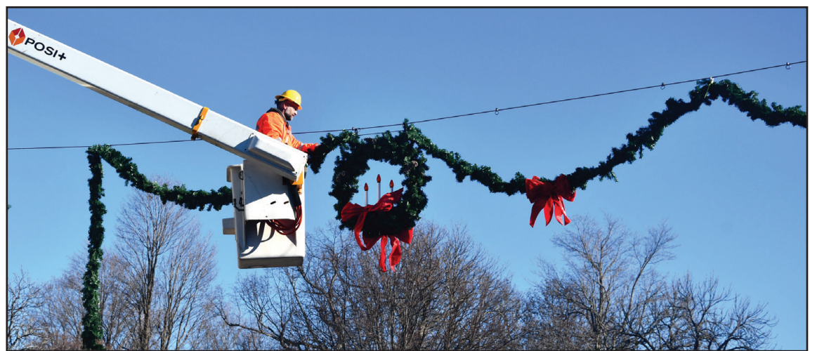
GARLAND ON MAIN STREET ADDS HOLIDAY TOUCH - While limited to two strands this season due to infrastructure needs, Village of Akron Mayor Brian Perry told residents at Light Up Akron! that the structures needed to support the garland will be in place in 2024 with a total of five strands across Main Street.

- 10 a.m. meet at Hinsdale Methodist Church, Main St, Hinsdale, NY. Enter (42.167278, -78.387766) coordinates into GPS device. 2 miles, easy.